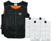
6260 Lightweight Phase Change Cooling Vest With Rechargeable Ice Packs