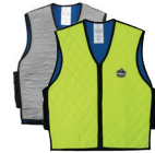
6665 Evaporative Cooling Vest - Embedded Polymers, Zipper Closure