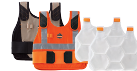
6215 Premium FR Phase Change Cooling Vest With Rechargeable Ice Packs