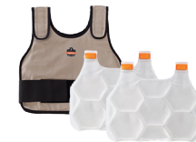
6230 Standard Phase Change Cooling Vest With Rechargeable Ice Packs